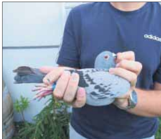
Van Tilburg 16-374.